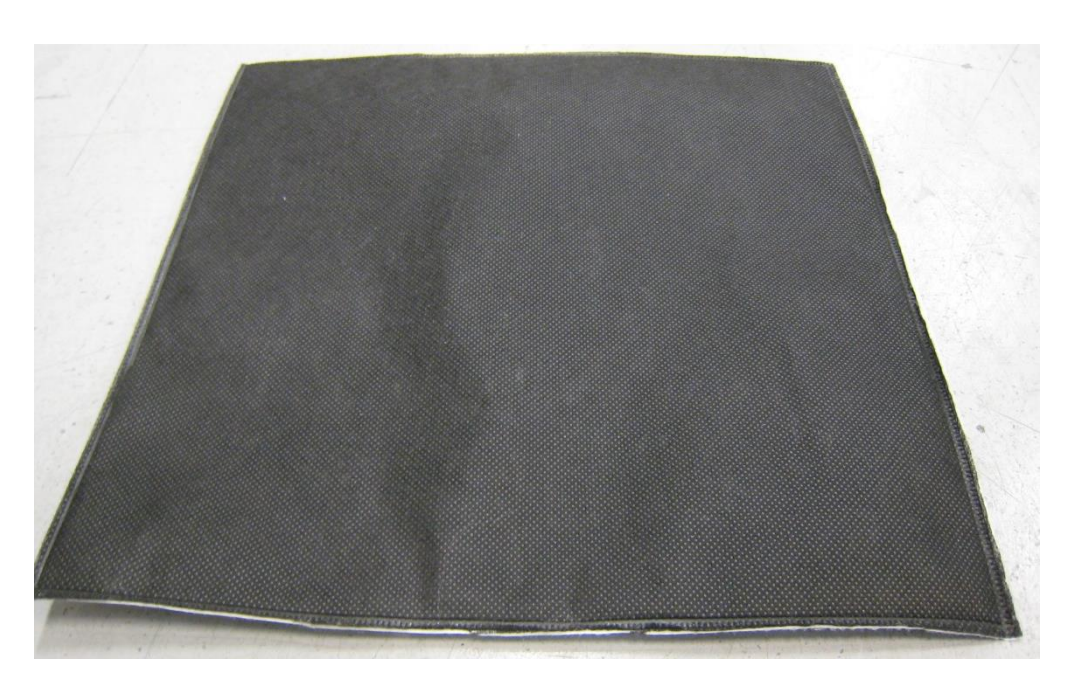
Fig 1. Overview of the filter material (upstream).