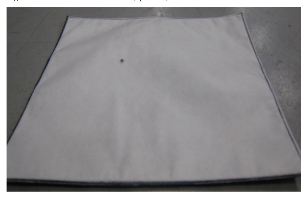
Fig 2. Overview of the filter material (downstream).