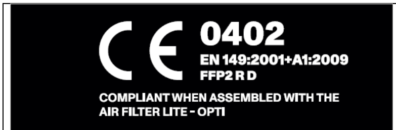
Picture of marking on mask skin Air Mask Lite